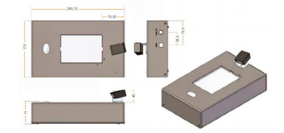
Figure 1: Impression MKI (PN: 20-2101-A)